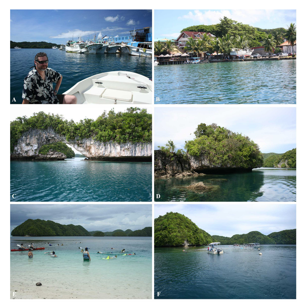
Figure 1. A selection of the survey sites in Palau: Malakal Harbour (A, B), "pristine" areas (C, D), and tourist sites (E, F).

to the survey in an ad-hoc fashion, with introduced or suspect introduced species being noted at all ad hoc sites. Samples from the hulls of three vessels were also collected in a qualitative fashion. Fouling communities were sampled at 16 sites; nine sites within Malakal Harbour and seven sites outside of the harbour, including three "pristine" sites in the Rock Islands (Figure 1). Standard 0.10 m<sup>2</sup> quadrats were used to sample hard substrate using the methods described in Hewitt and Martin (1996, 2001). Quadrats were sampled at three depths (-0.5m, -3m,