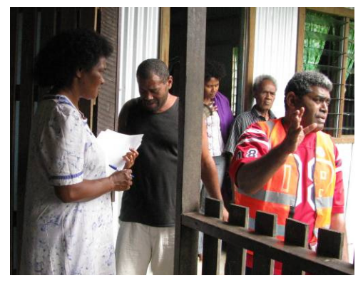
Fig. 9 PCIDRR Village Scenario, Namuka village

From the village level, the village committees are represented, and linked to the PCIDRR Project Team via Field Project Officers (FPOs). FPOs are local to the region, employed for the duration of PCIDRR and encourage the whole community to participate in the development of their village's CDP. The PCIDRR Project Team (which includes the FPOs) then liaises closely with the National Disaster Management Office (NDMO) and the National Steering Committee, as well as the management team from NCCA and the Adventist Development Relief Agency (ADRA), who are contracted to manage the training component of the project.