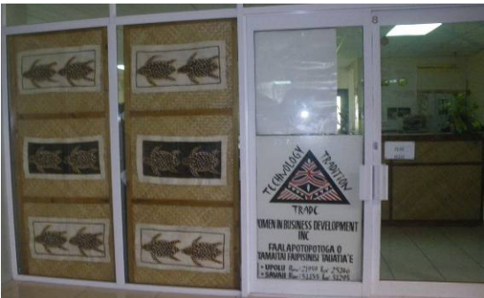
Fig. 7 WIBDI Office, Apia, Samoa

The targeted disaster management aspect of WIBDI's work began in 2008 with the first dedicated Disaster Management Officer who began looking into traditional methods for disaster preparedness and risk reduction, including food preservation techniques. WIBDI's current initiative for disaster risk reduction (DRR) and climate change adaptation (CCA) revolves around food security. Its approach, however, is holistic, extending to all aspects of sustainable livelihoods for people living in rural areas across Samoa.