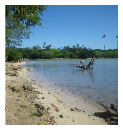
4. Integration of DRR and CCA

CBA initiative is funded by the GEF and co-financed by the Australian Agency for International Development (AusAID). This is channeled through AusAID's Vulnerability and Adaptation Programme for Samoa. Total financing from the two donors is US$50,000 each, however the total funding required is US$400,000. The remaining funds will be raised from other sources.