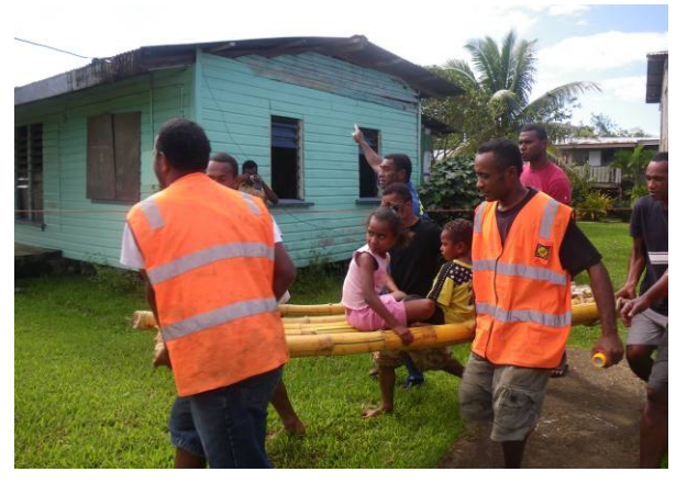
Fig. 10 PCIDRR Village Scenario, Naimalavau village July 2009

Link to National DRR Structure: A further aim of PCIDRR is for the NDMOs to see PCIDRR as part of their own overall program of addressing DRR in their respective countries, thus contributing to capacity building of the national DRR framework.