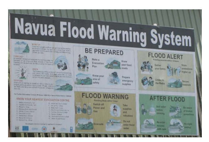
Fig. 5 Navua Flood Warning sign

this two year project is to build upon a previous project, which was funded by the European Union (EU) and developed an early warning system for flood. The LLRM project extends the EU funded initiative to work closely with the community, local organisations and various levels of government to reduce the area's risk to flooding. Additional tools such as the Red Cross's Vulnerability and Capacity Assessment (VCA) further allowed insight into how people in Navua could enhance their resilience in terms of natural hazards.