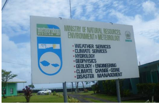
Fig. 1 DMO Office at Mulinuu, Apia, Samoa

Samoa is fortunate to have a fairly long history in developing baseline information regarding natural hazards and vulnerability across the country to allow for future projects to by-pass the often time consuming task of assessing the needs of a community. For example, Coastal Infrastructure Management (CIM) Plans were conducted over the period of 1999 – 2007, and involved extensive participatory community engagement resulting in village specific plans. This has provided the means for many donors and