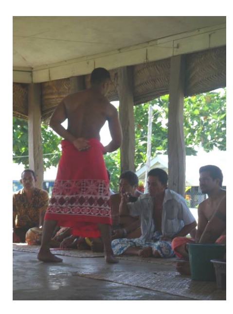
Fig. 8 Traditional ava ceremony

Development approach in tune with Samoan culture: WIBDI have always based their approach to building sustainable livelihoods on the basis of Samoan culture: the family. This way, their projects will be well received and situated in the right cultural context and therefore be sustainable as they are synchronised with the daily practices of Samoan people.